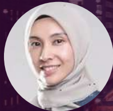
Y. Bhg. Puan Nurul Izzah Anwar Co-Chairperson of the Secretariat of the Special Advisory Body to the Minister of Finance