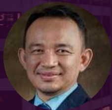
Dr. Maszlee Malik Former Minister of Education