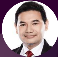
Y.B. Tuan Mohd Rafizi Ramli Minister of Economy